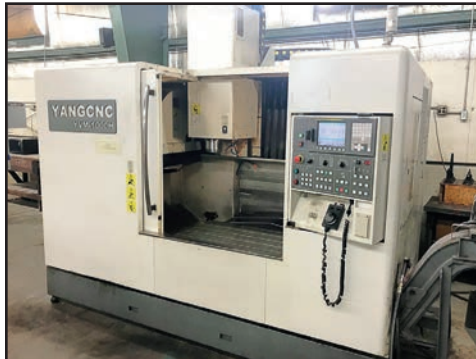
YANG YVM-1000H VERTICAL MACHINING CENTER