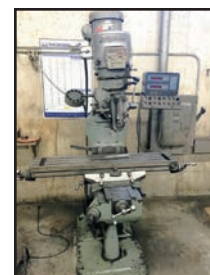
BRIDGEPORT SERIES 1 VERTICAL MILL

Online Bidding at www.perfectionindustrial.com