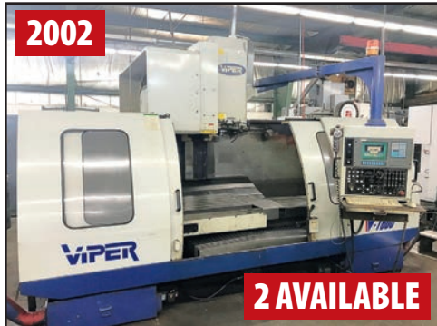
MIGHTY VIPER V-1600 VERTICAL MACHINING CENTER