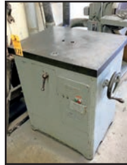
MASTER 2 SP ORBITAL DRUM SANDER