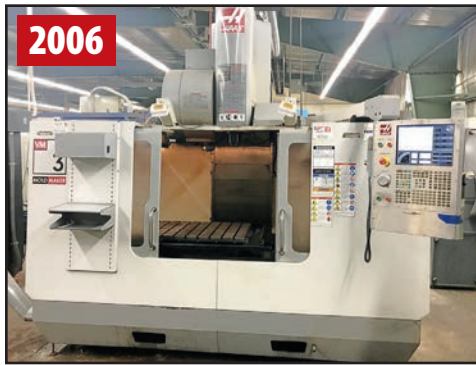
HAAS VM3 VERTICAL MACHINING CENTER