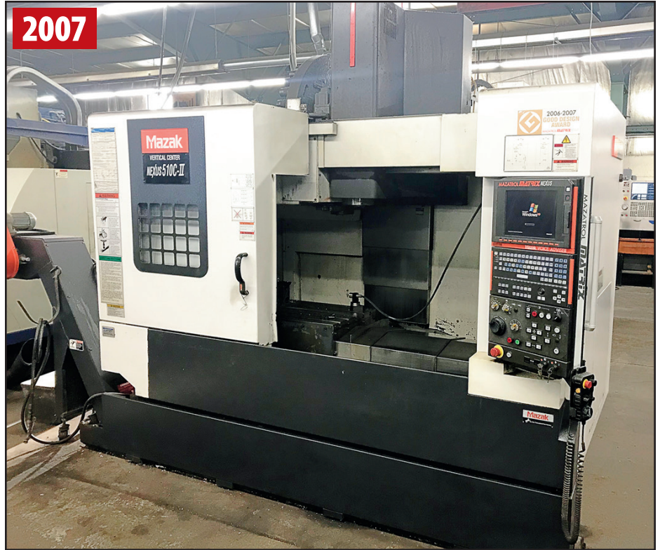
MAZAK NEXUS 510C-II VERTICAL MACHINING CENTER

FEATURING: Mazak, Haas, Mighty & Yang CNC Vertical Machining Centers, Conventional Machine Tools, Horizontal & Vertical Bandsaws, Forklifts, Large Quantity of Tooling, CMM, Inspection Equipment, Woodworking & More