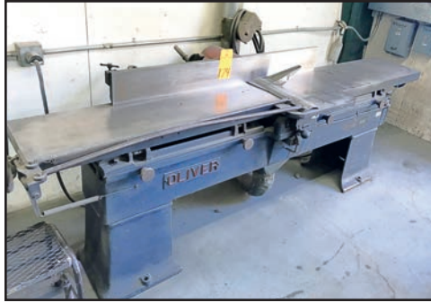
OLIVER 166-BD JOINTER