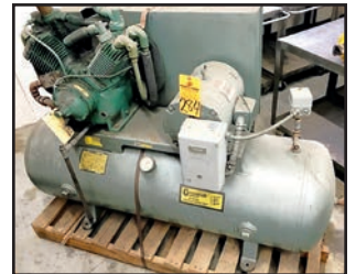
COMPRESSED AIR SYSTEMS 20-277 AIR COMPRESSOR