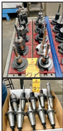
LARGE ASSORTMENT OF CAT TOOL HOLDERS