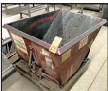
GALBREATH LH50 AND H25 DUMP HOPPERS