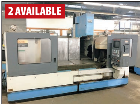
MAZAK VTC-30C VERTICAL MACHINING CENTER