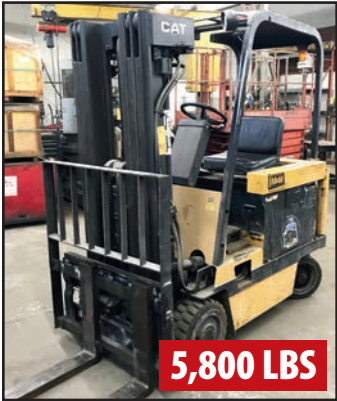
CATERPILLAR MC60DSA ELECTRIC FORKLIFT