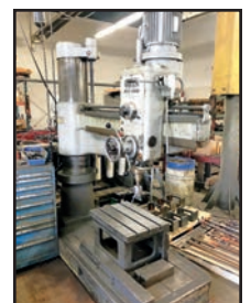
Ooya REZ-1450 RADIAL DRILL

To discuss your requirements for an auction, please call Perfection Industrial +1-847.427.3333