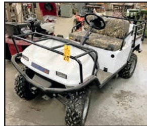
COLUMBIA PARCAR UTILITY VEHICLE