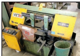
VICTOR SH-1016 JYM HORIZONTAL BANDSAW

Online Bidding at www.perfectionindustrial.com