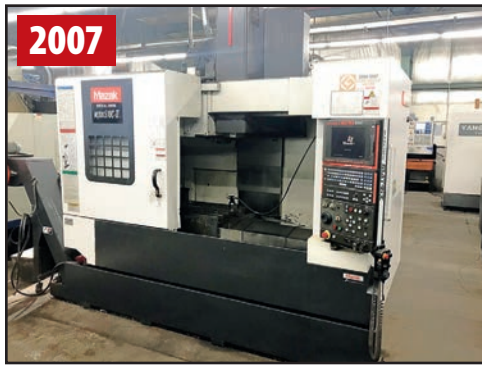
MAZAK NEXUS 510C-II VERTICAL MACHINING CENTER