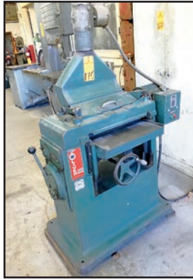
OLIVER 399-D PLANER