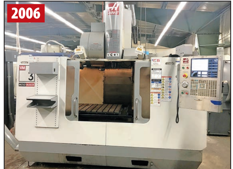
HAAS VM3 VERTICAL MACHINING CENTER

Sale Closing Date: Wednesday, November 20th at 11:00 AM CT