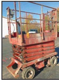
SKYWITCH 7622EXT SCISSOR LIFT