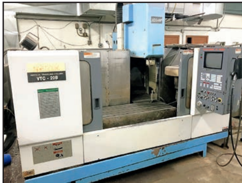
MAZAK VTC-20B VERTICAL MACHINING CENTER