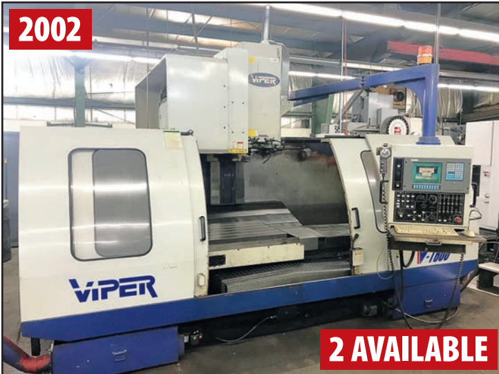
MIGHTY VIPER V-1600 VERTICAL MACHINING CENTER