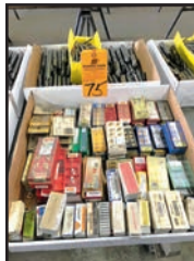
LARGE QTY. OF CARBIDE END MILLS AND INSERTS