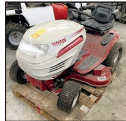
WHITE OUTDOOR LAWN TRACTOR