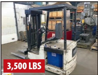
CROWN 355CTL-S 3 WHEEL FORKLIFT