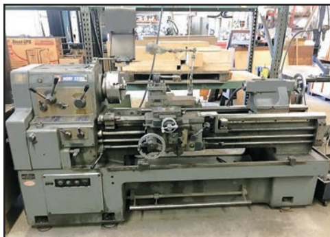
MORI SEIKI MS-1250G LATHE